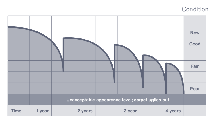
Diagram 3 Carpet appearance level utilising an unplanned maintenance program.