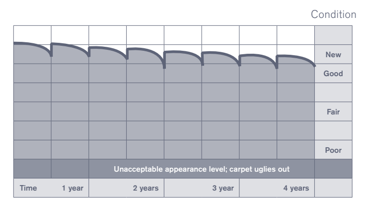
Diagram 2 Carpet appearance level utilising an planned maintenance program.