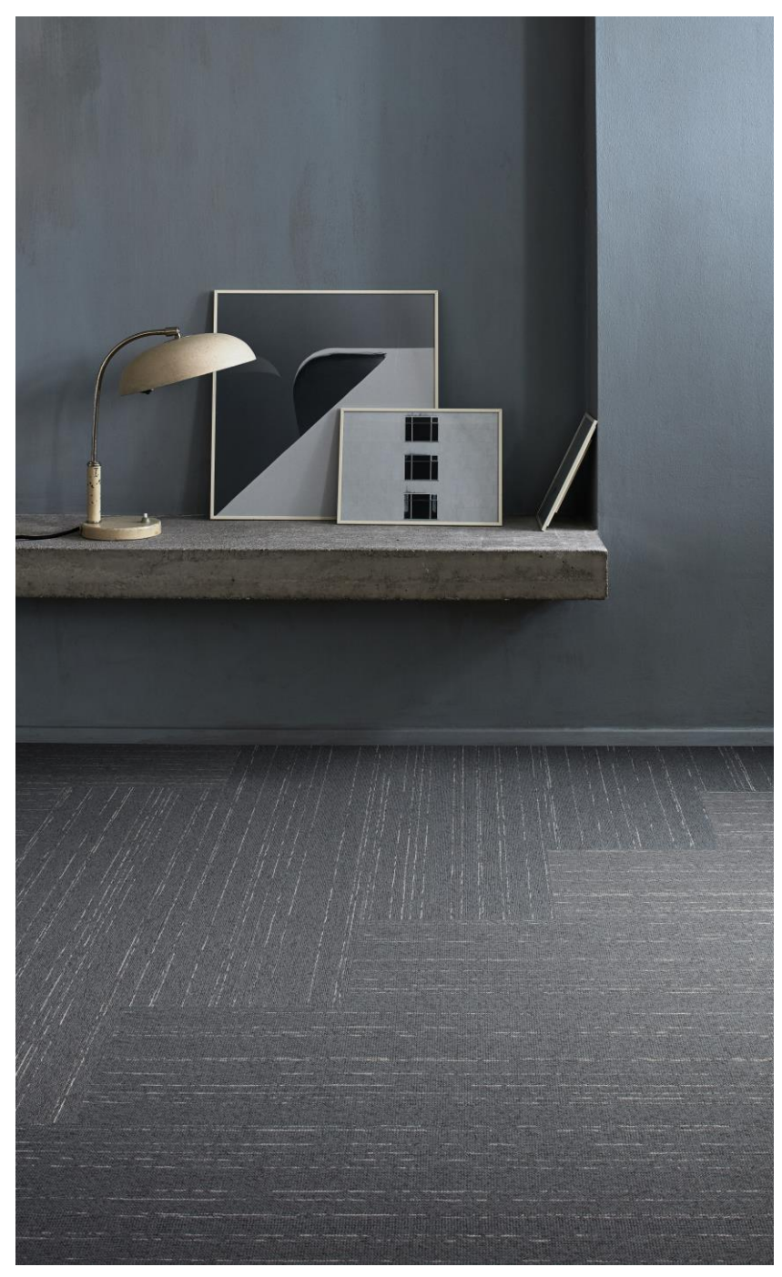
Flash Line Flash Line has a non-vinyl bio-composite backing made with bio-resins, fillers, and bio-oils, which is net carbon negative.