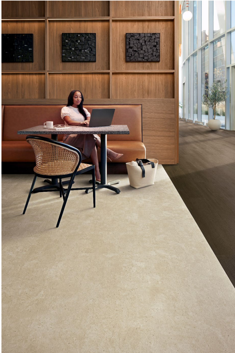
Modular Resilient Flooring 4.5 mm Luxury Vinyl Tile