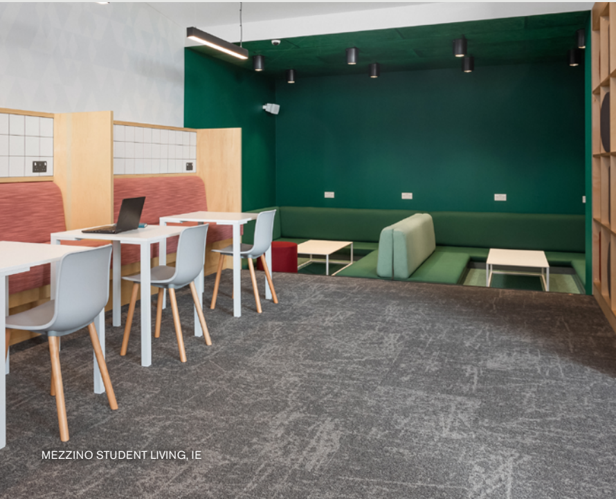
MEZZINO STUDENT LIVING, IE