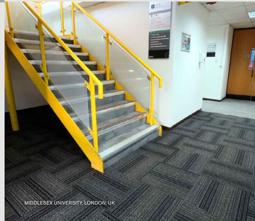
MIDDLESEX UNIVERSITY, LONDON, UK