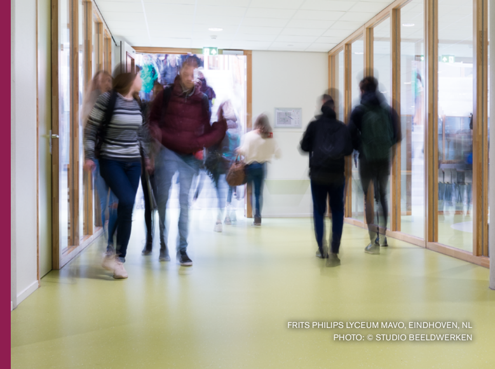
FRITS PHILIPS LYCEUM MAVO, EINDHOVEN, NL