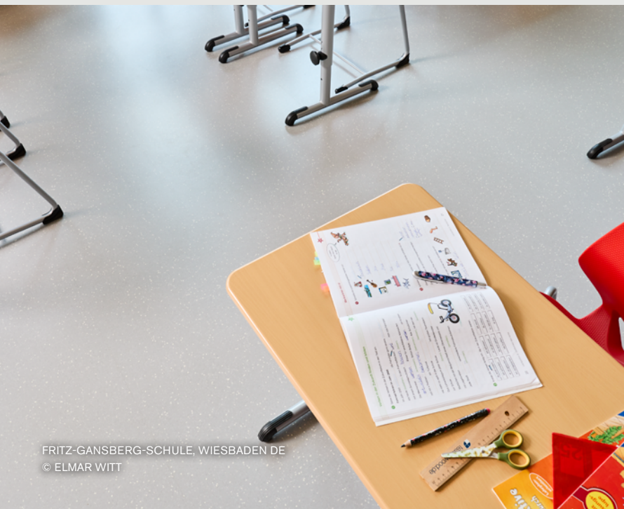
FRITZ-GANSBERG-SCHULE, WIESBADEN DE