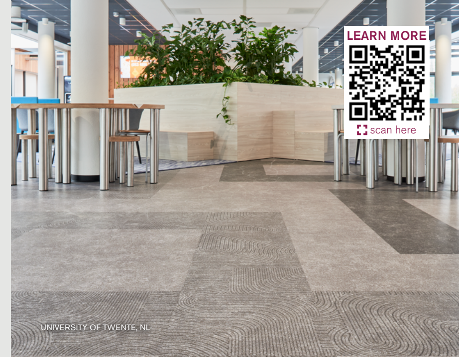
UNIVERSITY OF TWENTE, NL

4.5MM WITH SOUND CHOICE+™ BACKING AS STANDARD