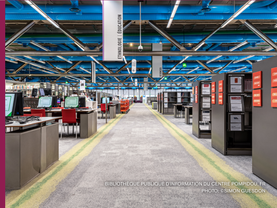
BIBLIOTHÈQUE PUBLIQUE D'INFORMATION DU CENTRE POMPIDOU, FR