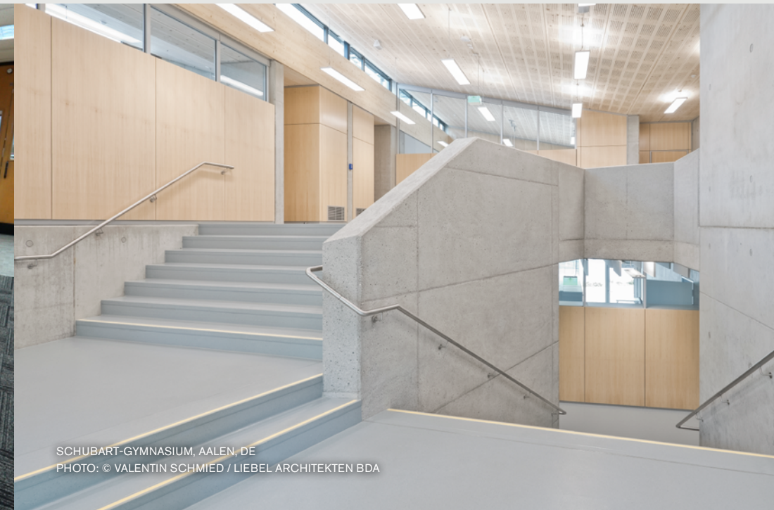
SCHUBART-GYMNASIUM, AALEN, DE PHOTO: © VALENTIN SCHMIED / LIEBEL ARCHITEKTEN BDA