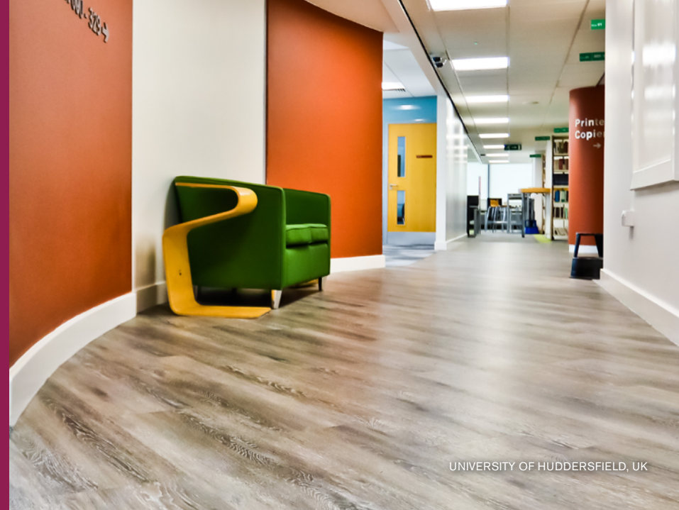
UNIVERSITY OF HUDDERSFIELD, UK

Interface products stand up to the unique demands of educational environments, and our flooring solutions offer wide-ranging benefits.