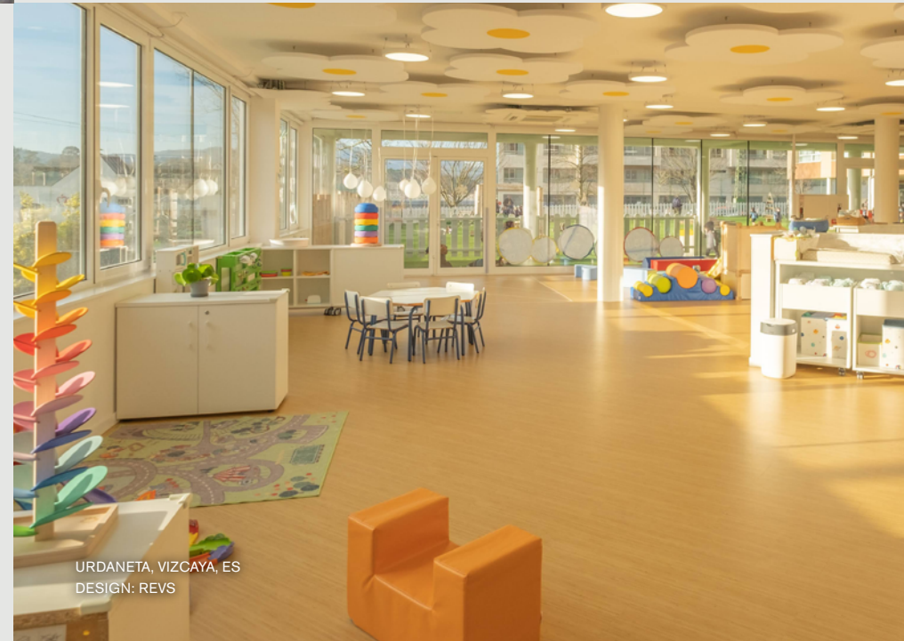
URDANETA, VIZCAYA, ES DESIGN: REVS