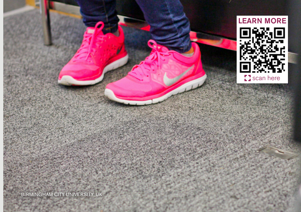
BIRMINGHAM CITY UNIVERSITY, UK

EVERYTHING YOU LOVE ABOUT SOFT FLOORING BUT WITH THE FLEXIBILITY OF TILE.