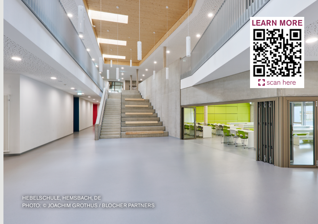
HEBELSCHULE, HEMSBACH, DE

SO DURABLE, IT CAN LAST FOR DECADES— AND STILL LOOK GOOD.