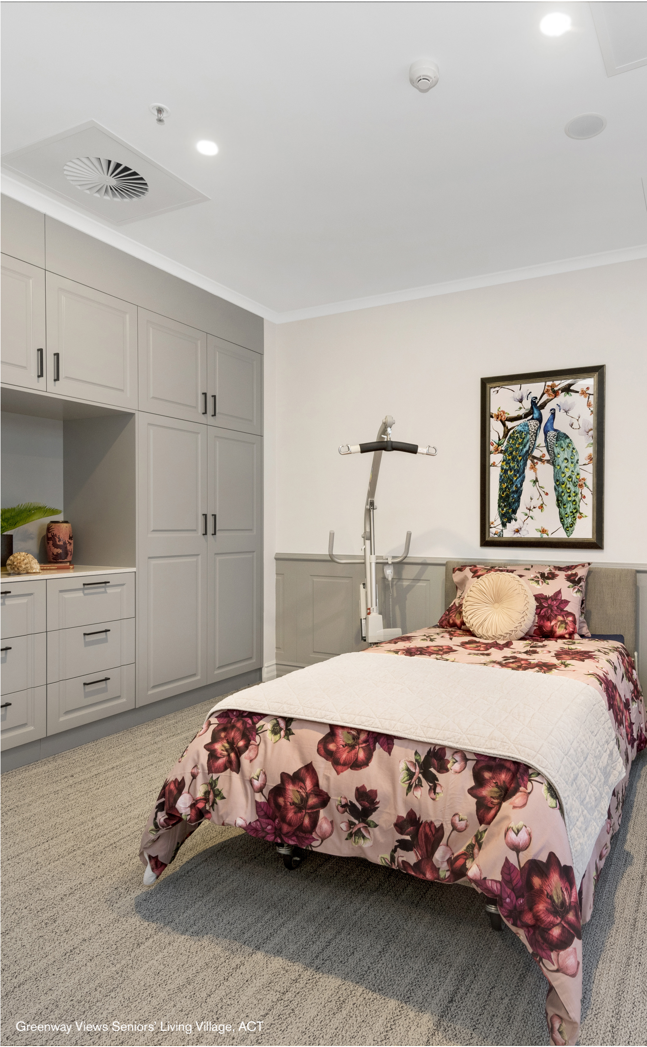
Greenway Views Seniors' Living Village, ACT