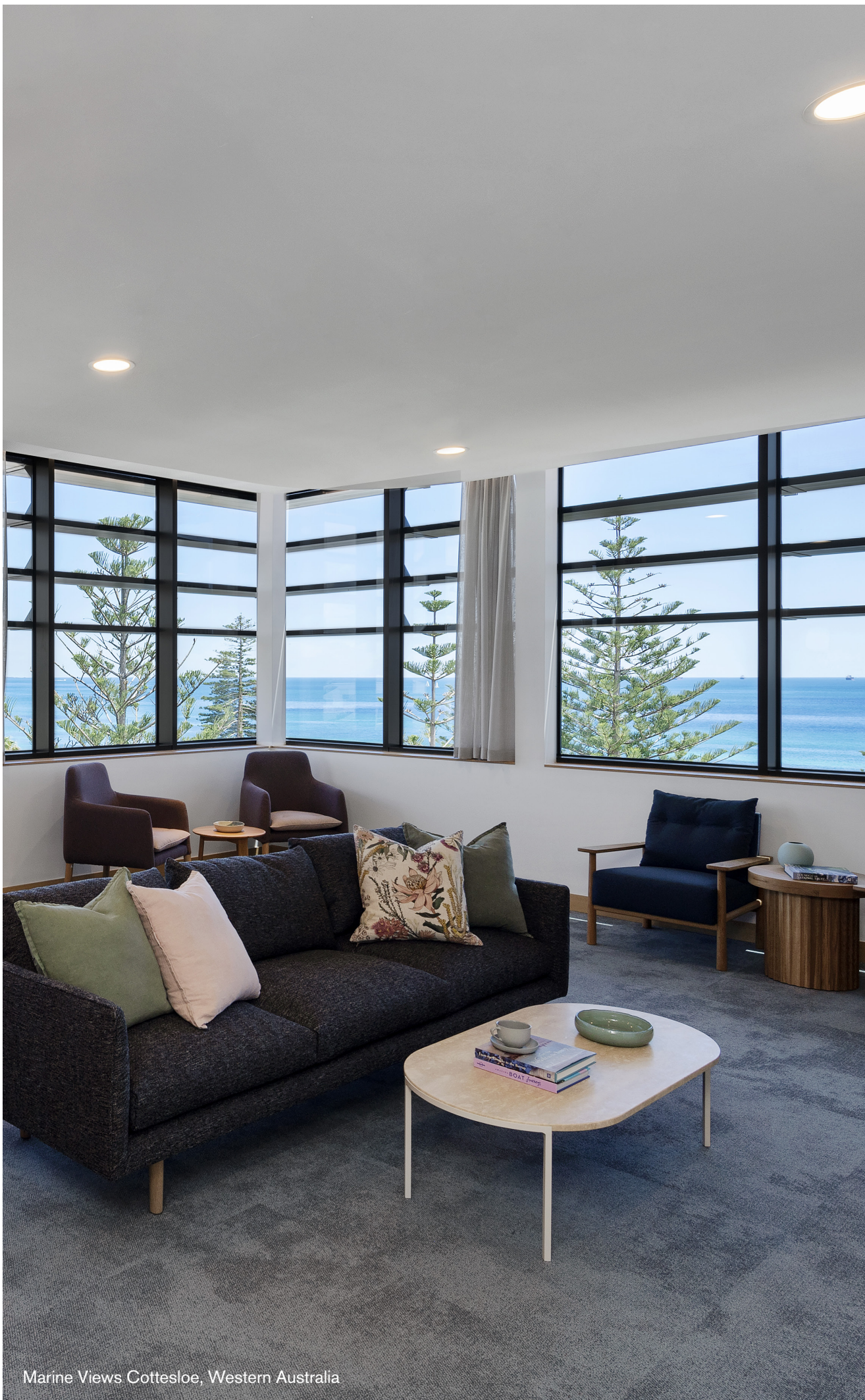
Marine Views Cottages, Western Australia