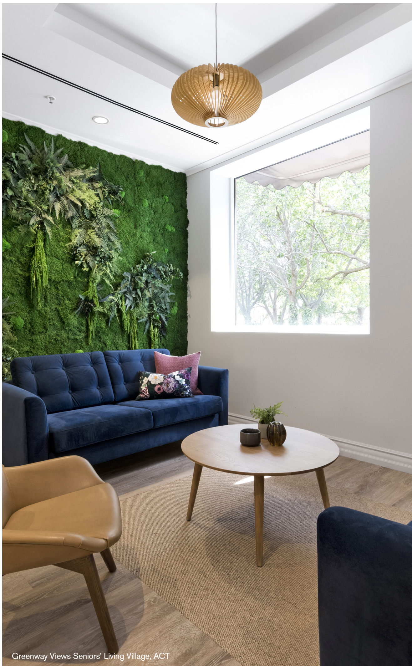
Greenway Views Seniors' Living Village, ACT