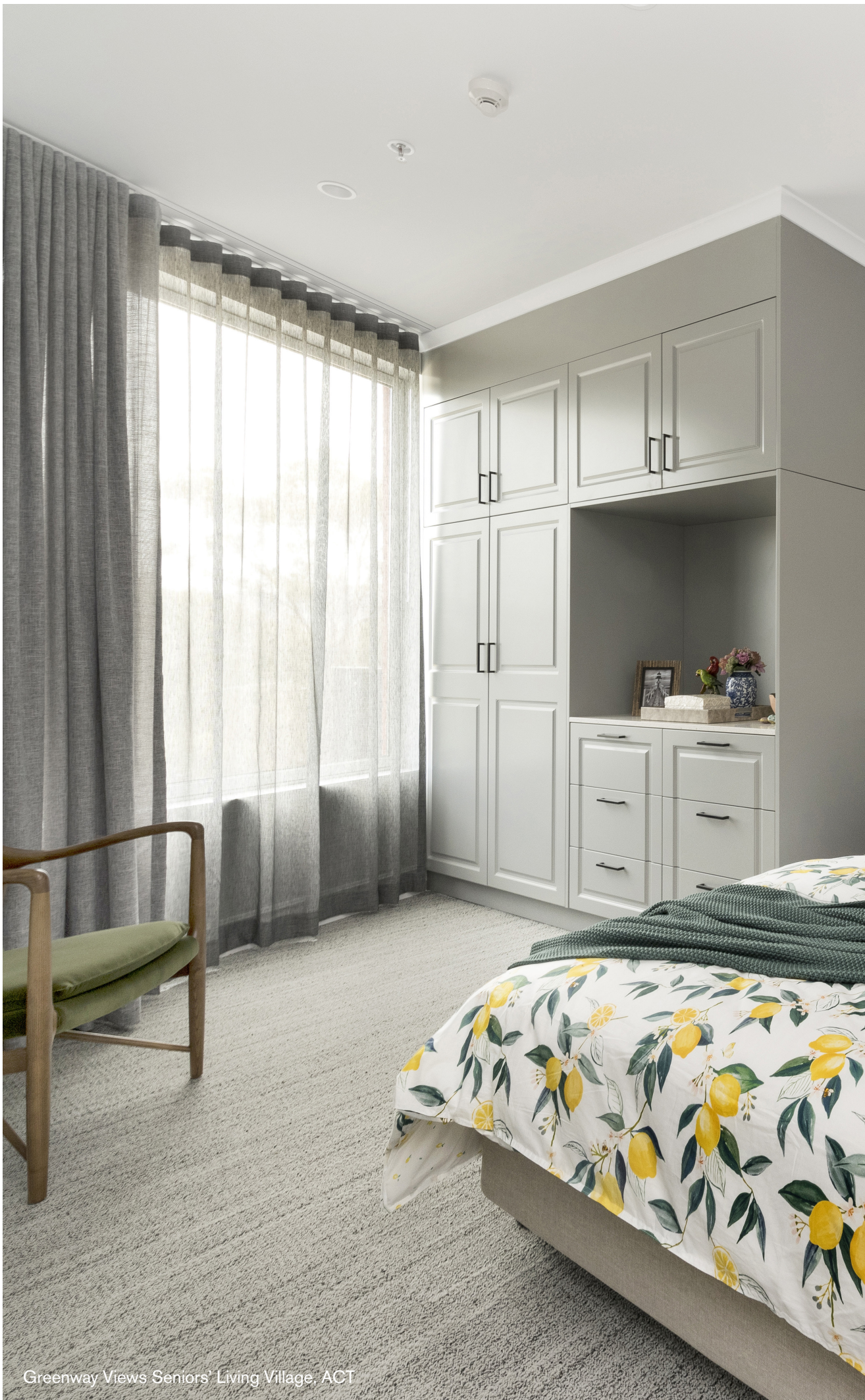
Greenway Views Seniors' Living Village, ACT

The lifestyles of seniors are evolving. So are the communities they live in. Taking a cue from natural materials, these sophisticated floor palettes serve as a foundation for spaces that help connect people and invigorate their senses. Interface offers highly functional, stylish floorcovering solutions that can satisfy even the most stringent requirements for senior living spaces.