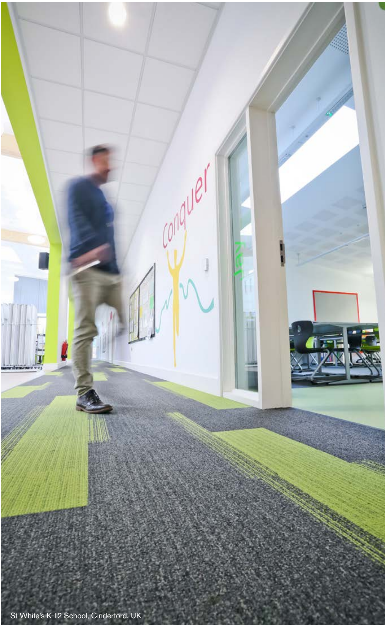
St White's K-12 School, Cinderford, UK