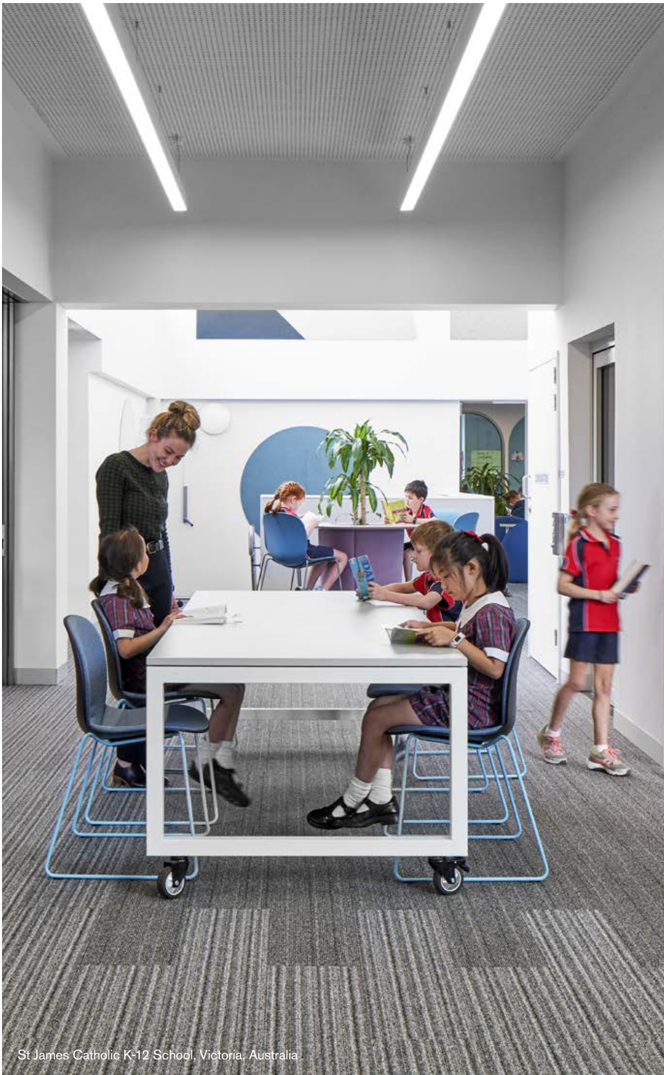
St James Catholic K-12 School, Victoria, Australia