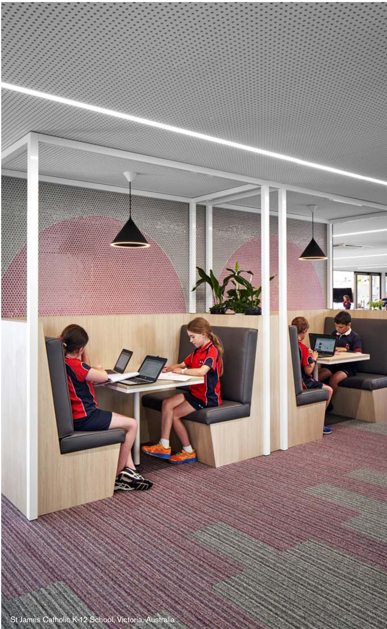
St James Catholic K-12 School, Victoria, Australia