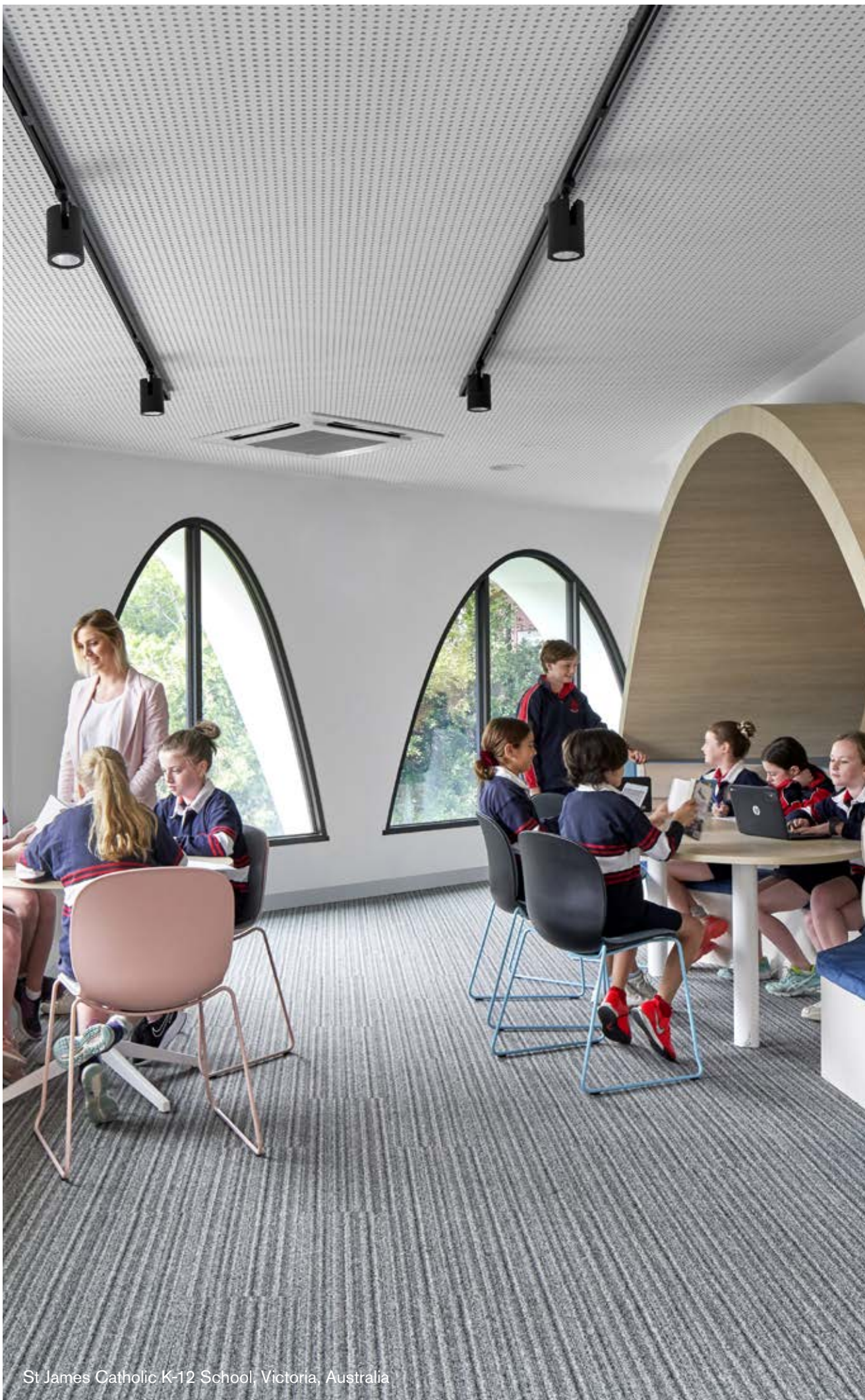
St James Catholic K-12 School, Victoria, Australia

Evaluating the best flooring solution for your space doesn't have to be difficult. Our integrated system of carpet tile, LVT and nora® rubber offers the best of hard and soft surfaces working together as a system to create the space you need for your community to thrive.