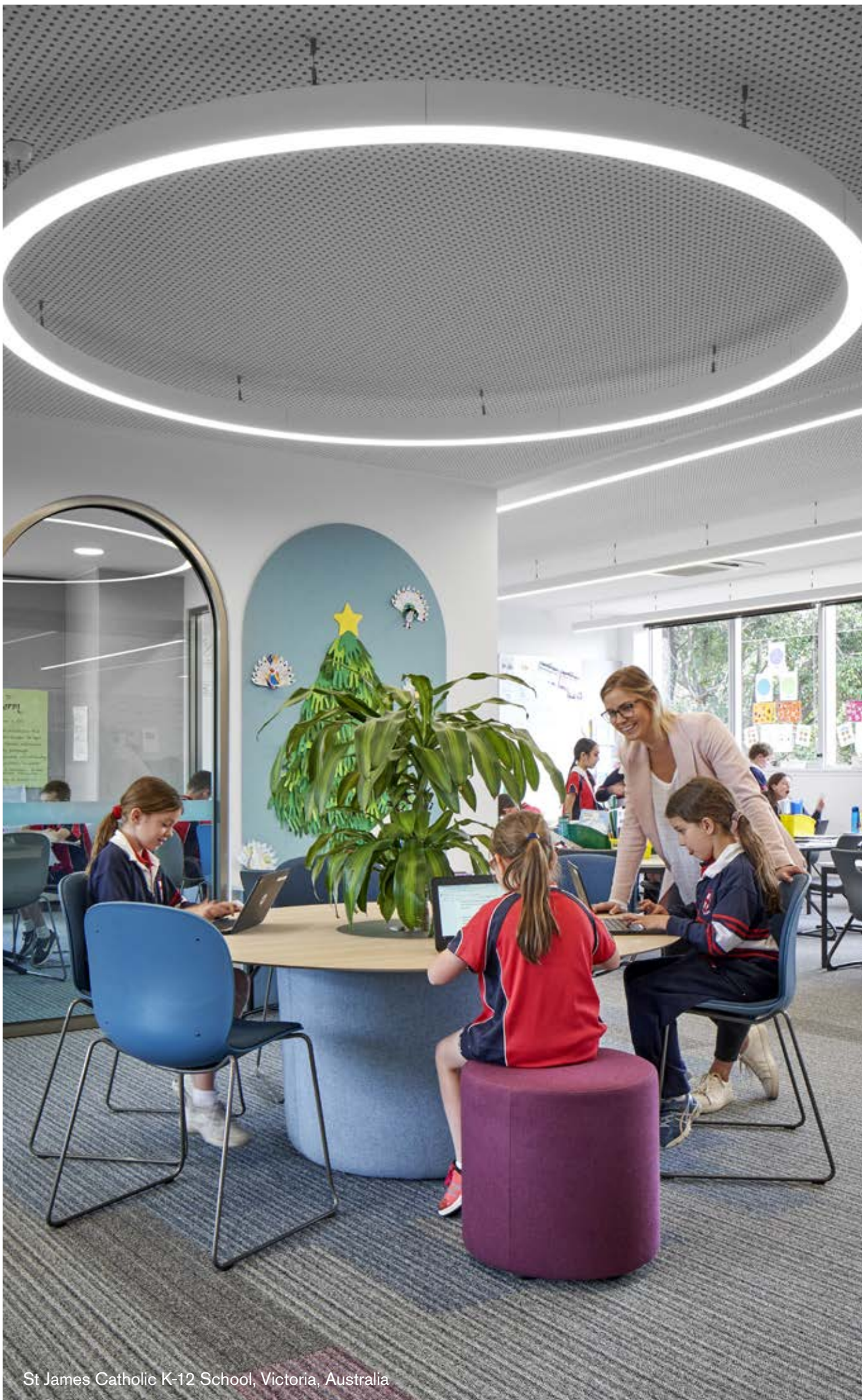
St James Catholic K-12 School, Victoria, Australia

Everyone has an innate desire to see and feel this connection. It's called biophilia. And design that embraces biophilic principles – by bringing the outside inside – is probably one of the most powerful ways of enhancing a sense of well-being in learning environments.