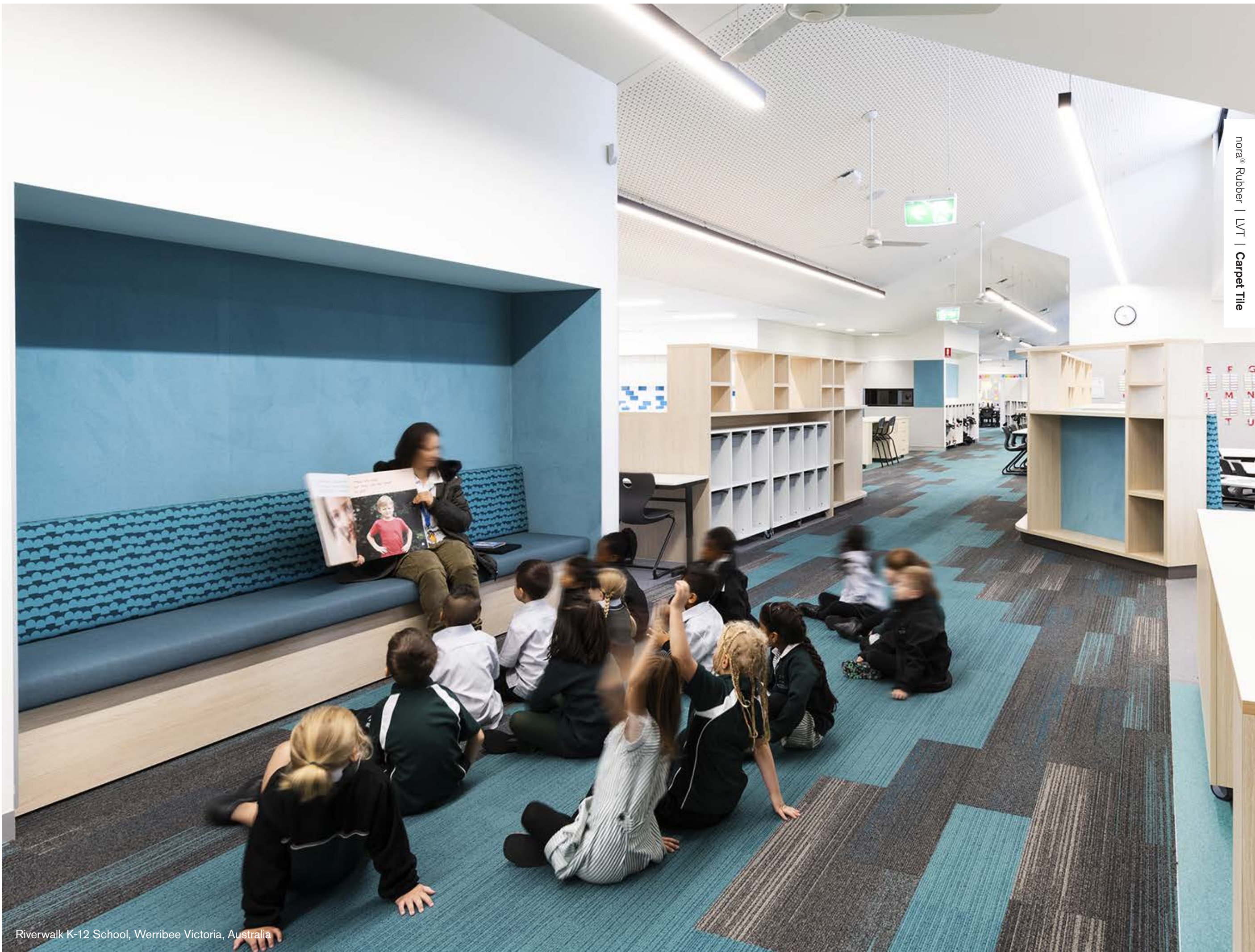
Riverwalk K-12 School, Werribee Victoria, Australia