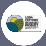
USDA BioPreferred® CQuestBio backing