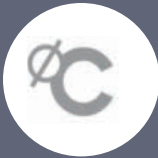
Carbon Neutral Floors™ All Products

To make sure we’re “walking the walk,” Interface enlists outside partners to help us evaluate and reduce the life cycle impact of our flooring products.