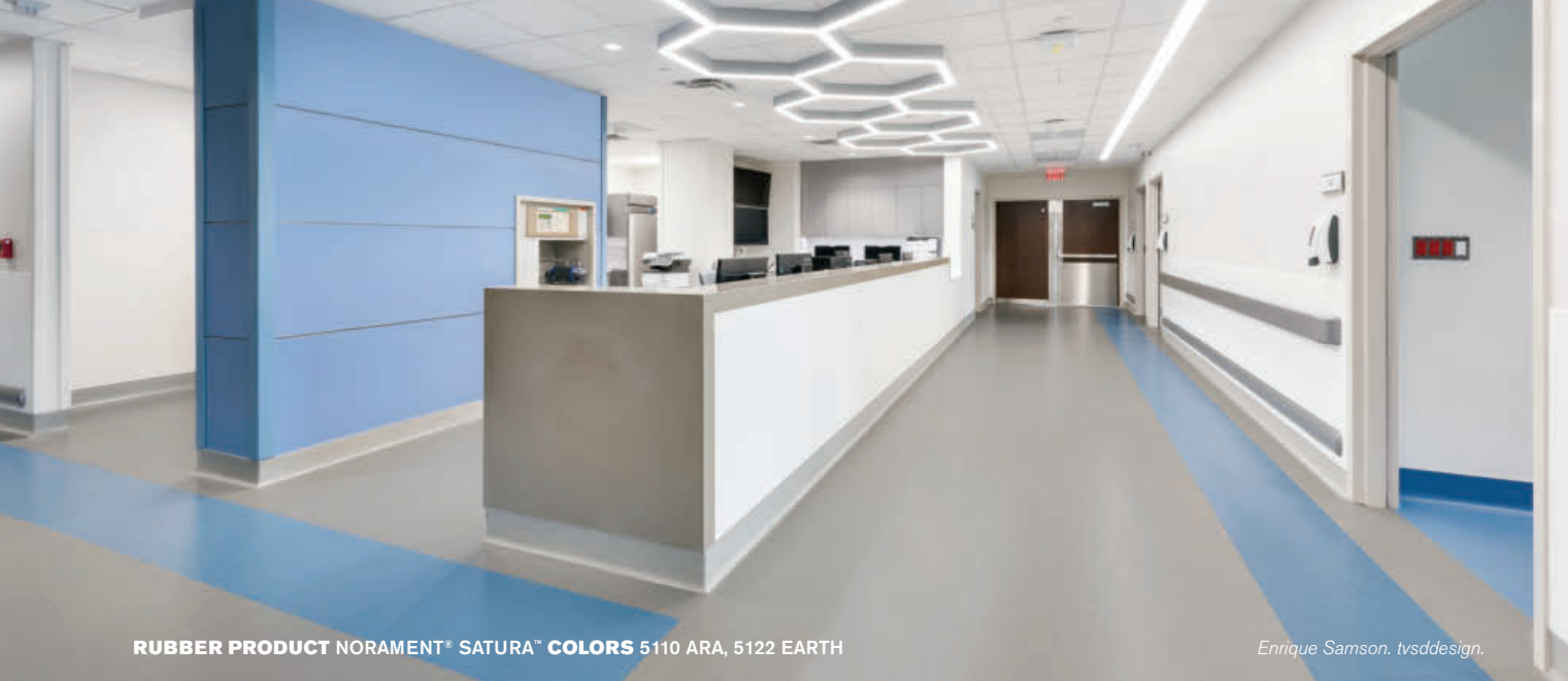
RUBBER PRODUCT NORAMENT® SATURA™ COLORS 5110 ARA, 5122 EARTH