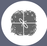
ReEntry™ Program Sound Choice, LVT, Carpet Tile