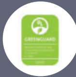
GREENGUARD Gold nora® rubber, LVT, Vinyl Sheet