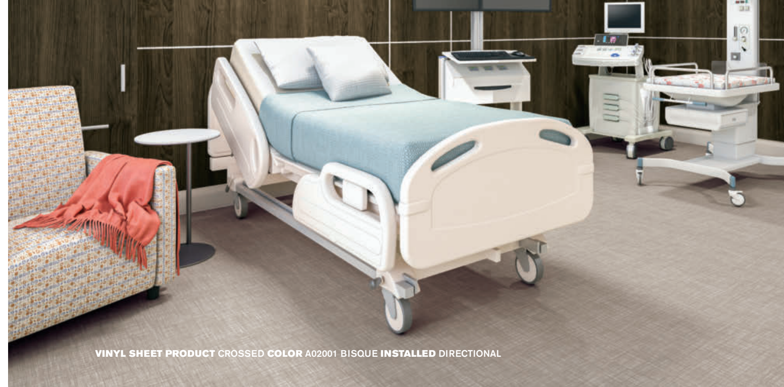
VINYL SHEET PRODUCT CROSSED COLOR A02001 BISQUE INSTALLED DIRECTIONAL