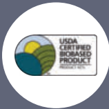
USDA BioPreferred® CQuestGB backing