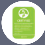
NSF 332 Silver LVT