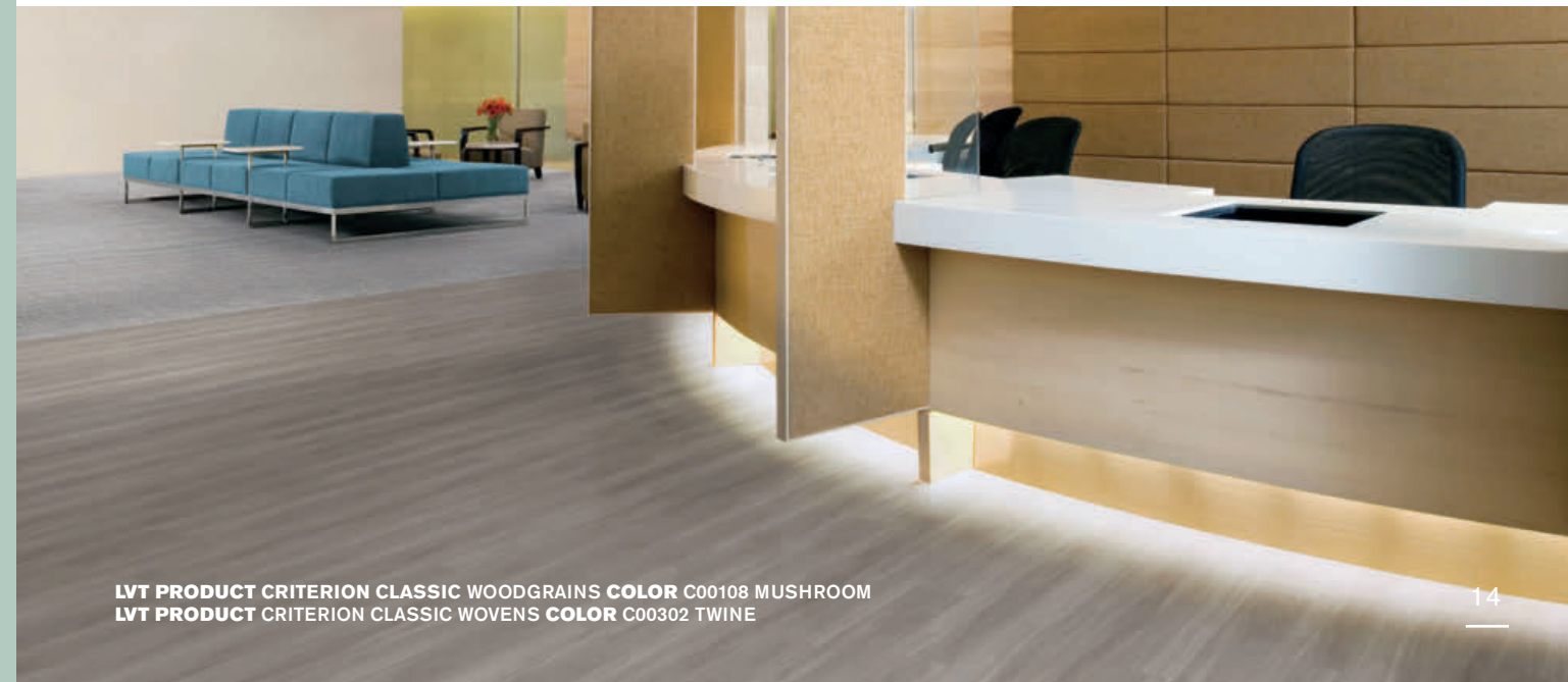
LVT PRODUCT CRITERION CLASSIC WOODGRAINS COLOR C00108 MUSHROOM LVT PRODUCT CRITERION CLASSIC WOVENS COLOR C00302 TWINE