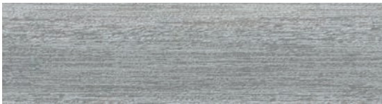
4191-005-000 Silver Birch