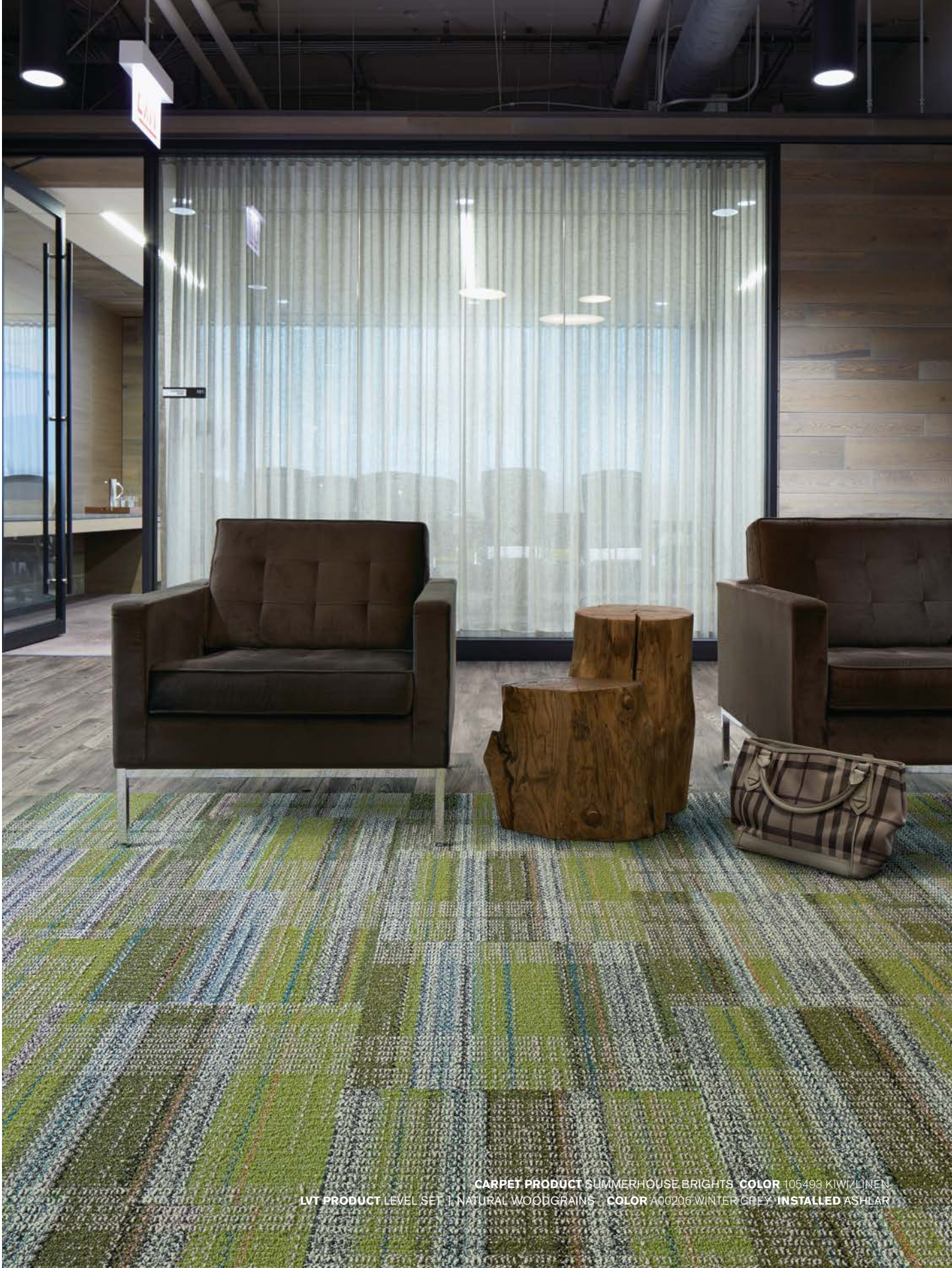
CARPET PRODUCT SUMMERHOUSE BRIGHTS COLOR 105493 KIWI/LINEN LVT PRODUCT LEVEL SET 1, NATURAL WOODGRAINS COLOR A00206 WINTER GREY, INSTALLED ASHLAR