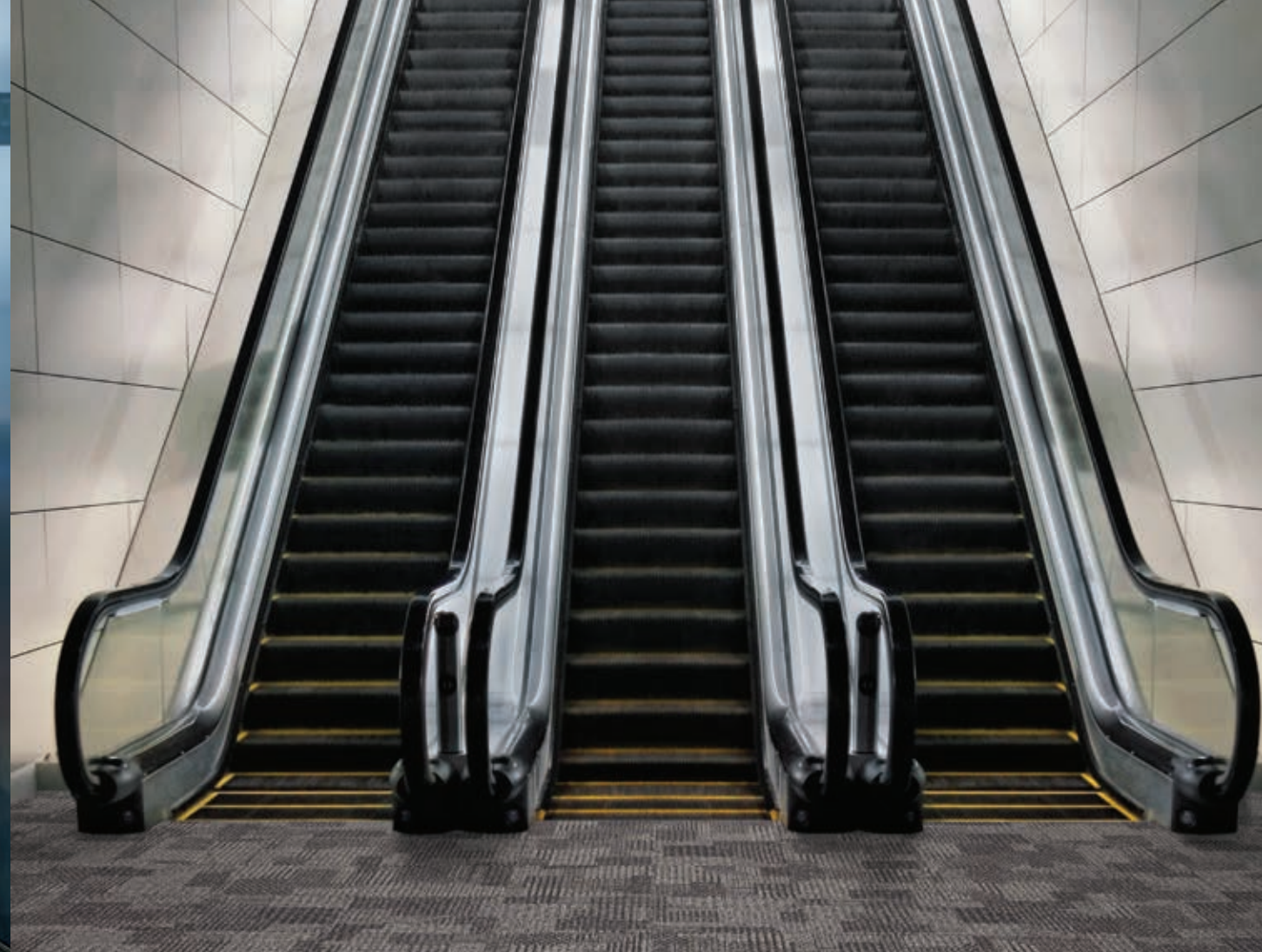
Product SR999 Colour Iron Installed Non-directional