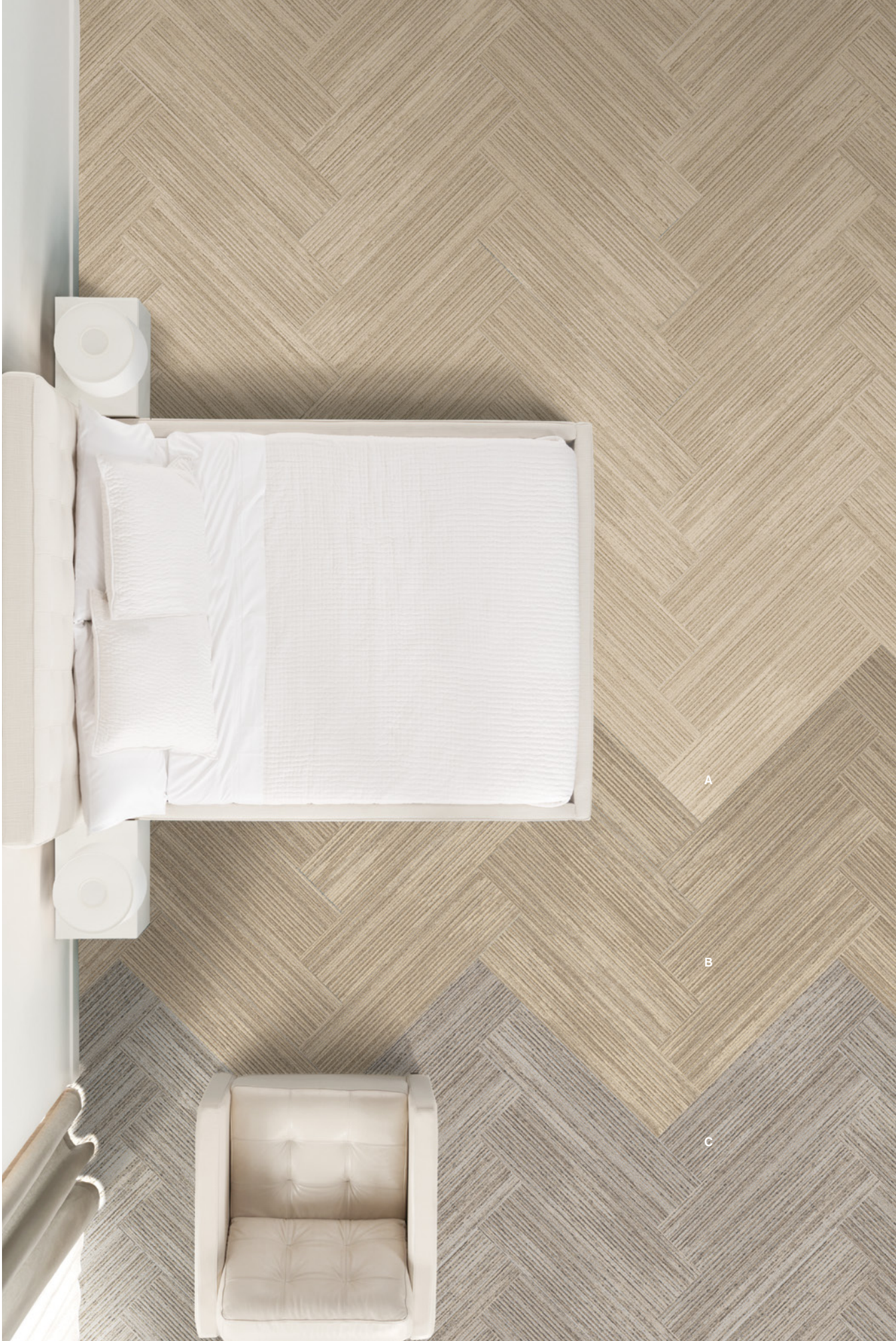
A PRODUCT: SWTS 110 SIZE: 25cm x 1m COLOR: Canvas INSTALLATION: Ashlar