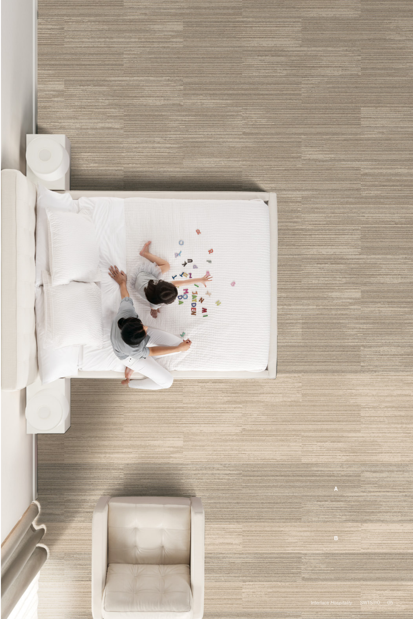
B PRODUCT: SWTS 110 COLOR: Vanilla SIZE: 25cm x 1m INSTALLATION: Ashlar