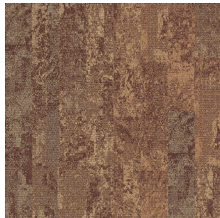
103698 TERRA COTTA