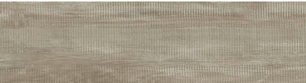
A00422 RUSTIC HICKORY