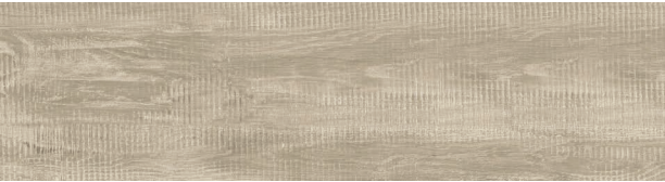
A00421 RUSTIC OAK