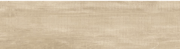
A00420 RUSTIC CASHEW

All product specifications reflect averages derived from product sample testing, are subject to normal manufacturing and testing tolerances and inherent pattern variances, and may be changed without notice. For more information about these and other important attributes of the product(s) described herein, including recycled content and product warranty information, please see our full LVT product disclaimer @ interface.com.