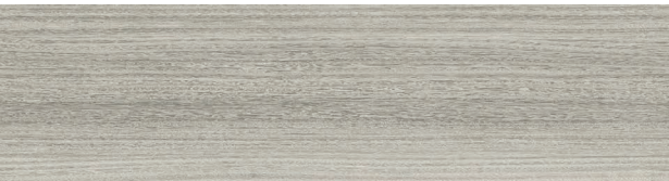
A00428 GREY ADLER