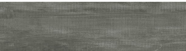
A00425 RUSTIC CHARCOAL