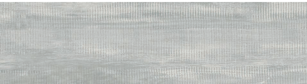
A00424 RUSTIC BIRCH