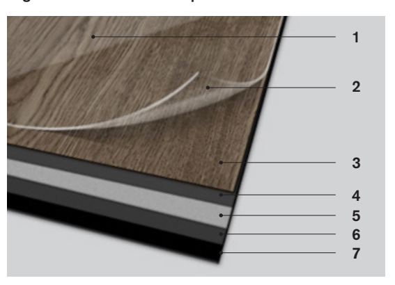
High Performance from Top to Bottom

Silence distractions. Sound Choice is a specially formulated backing for superior noise reduction, offering you best-in-class impact sound reduction and floor to floor sound transmission.