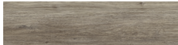
A05005 PEBBLE OAK