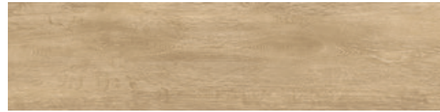
A05001 HONEY OAK