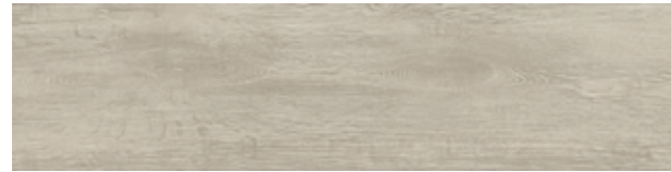
A05002 STERLING OAK