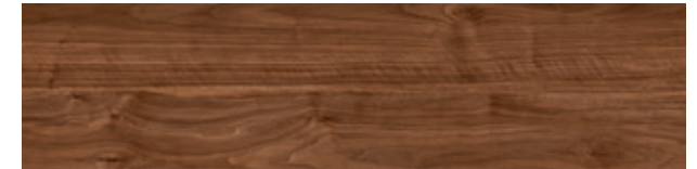
A05015 STAINED MAPLE