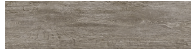
A05008 CARBON OAK