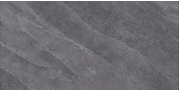
A07004 LONDON FOG