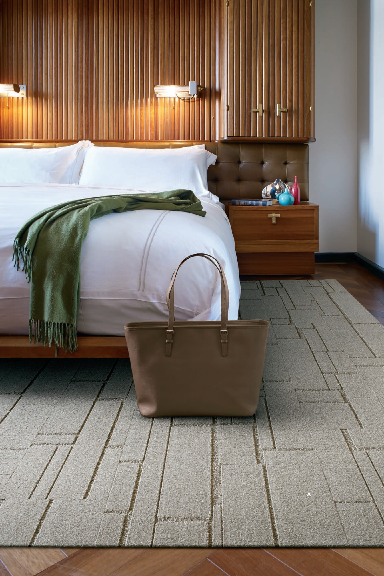
A PRODUCT: EM553 SIZE: 26cm x 1m COLOR: Cobblestone Blvd. INSTALLATION: Ashlar