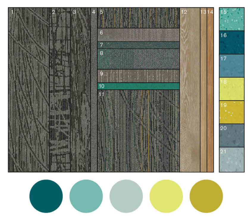
WE152: Granite 106275, 2) WE153: Granite 106283, 3) WE151: Granite 106267, Neighborhood Smooth: Greige/Smooth 105304, 5) Farmland Loop: Granite 106569, 6) AE310: Greige 104625, Ice Breaker: Larimar 106194, 8) The Standard: Larimar 106188, 9) Night Flight: Titanium 106471, Viva Colores: Agua 106031, 11) Prairie Grass Loop: Grass 106565, Criterion Classic Woodgrains: Antique Light Oak C00106, 13) Criterion Classic Woodgrains: Washed Maple C00104, Criterion Classic Woodgrains: Cedar C00105, 15) norament Grano: Wintergreen 5321, norament Satura: Neptune 5129, 17) noraplan Sentica: Destination 6535, 18) noraplan Sentica: Aloe 6516, noraplan Environcare: Food Coma 7075, 20) norament Satura: Vela 5127, 21) norament Satura: Delphinus 5128