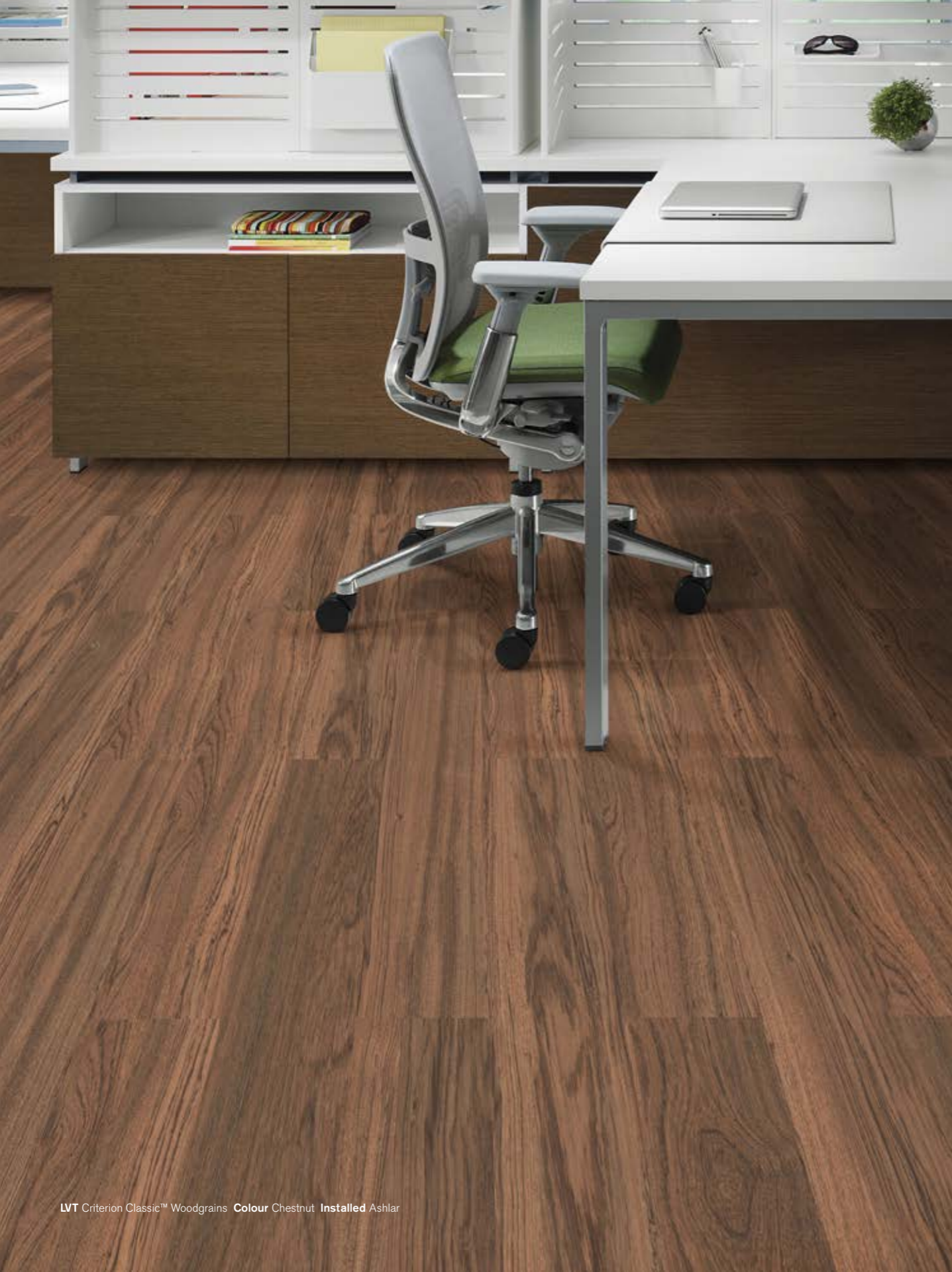
LVT Criterion Classic™ Woodgrains Colour Chestnut Installed Ashlar