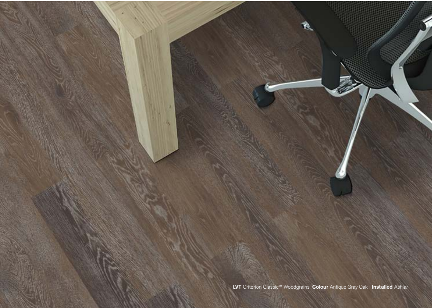
LVT Criterion Classic™ Woodgrains Colour Antique Gray Oak Installed Ashlar