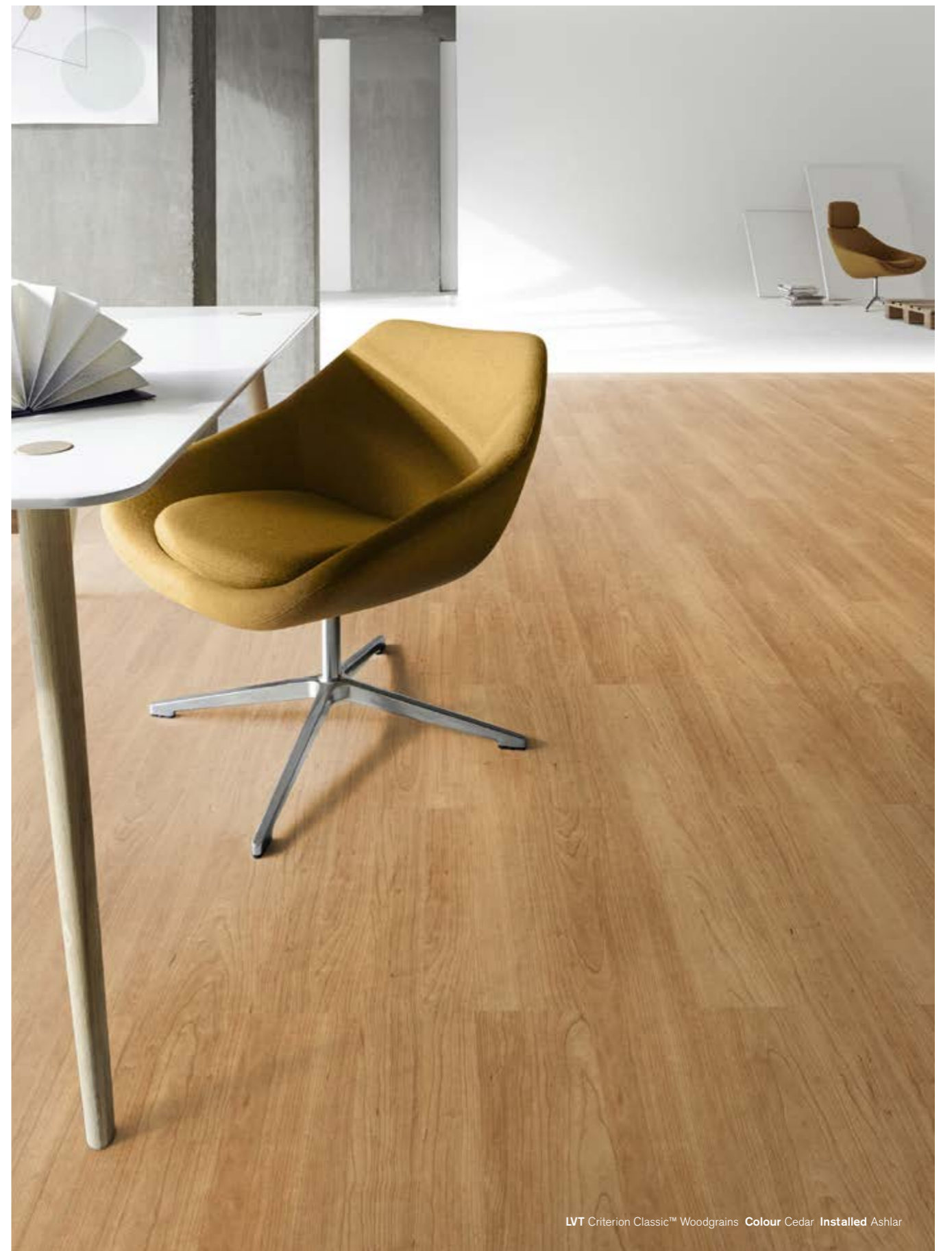
LVT Criterion Classic™ Woodgrains Colour Cedar Installed Ashlar