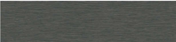
A01612 SOFT SHADOW