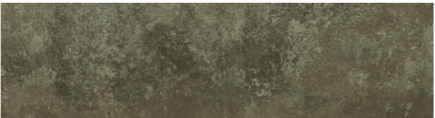
A00608 EVENING DUSK

Packaging Square Feet per Carton 26.91 sq. ft. (2.5 m²) Pieces per Carton 10 Weight per Carton 40 lbs (18 kg) Cartons per Pallet 40 Pallets per Truckload 20