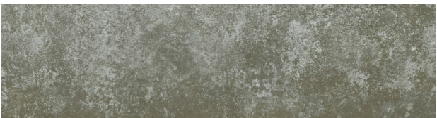
A00609 MORNING MIST

Technical Information Installation See Interface LVT Installation Guidelines online Maintenance See Interface LVT Maintenance Guidelines online Reclamation Recyclable through ReEntry® - Call 1.888.733.6873 (U.S.) / 1.866.398.3191 (Canada) Warranty 15 Year Limited Commercial Warranty Installation Methods Ashlar, Herringbone