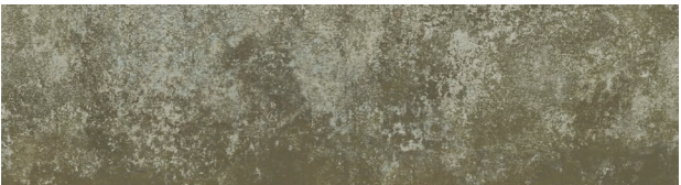
A00607 DESERT SHADOW

Environmental Indoor Air Quality FloorScore®/CDPH 01350 Certified for Low-VOC Emissions Material Composition Free of Ortho Phthalates, Added Formaldehyde and Heavy Metal Stabilizers Ingredients & Life Cycle Impacts Environmental Product Declaration Carbon Footprint 3rd Party Verified Carbon Neutral Sustainability Assessment NSF/ANSI 332, Meets Certification Guidelines LEED v4 Contributes to IEQ: Low Emitting Materials ; M&R: EPD and EPR End of Life Fully Recyclable LVT to Carpet Tile Backing